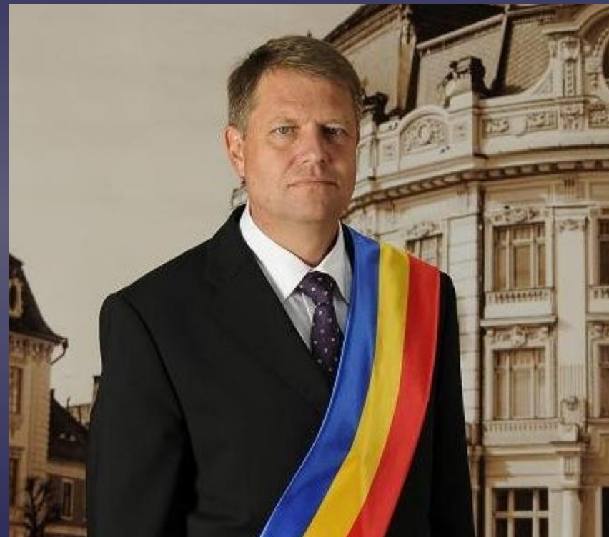
Klaus Werner Iohannis