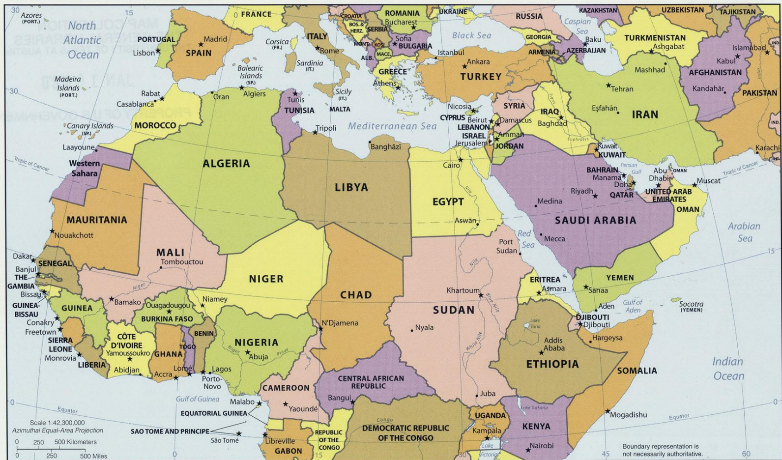
North Africa and the Middle East